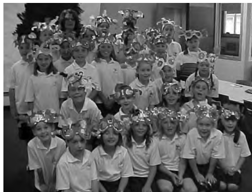
Class 4/3W designed glasses for Valentine's Day to raise money for the Fred Hollows Foundation. The "I Care, Eye Care" Day raised $437 for this worthy cause. All students were encouraged to take part in this activity.