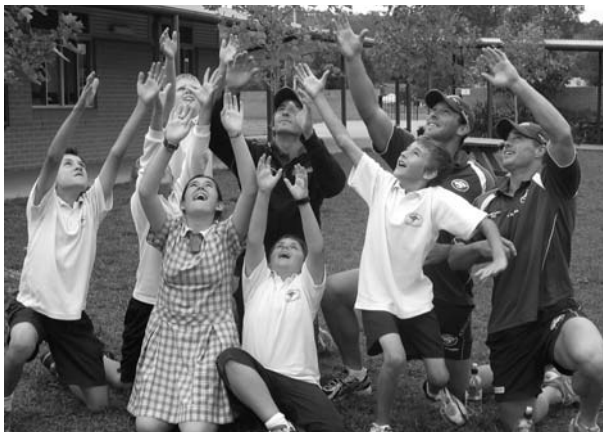
Reaching for the stars - Jerrabomberra students enjoyed a visit from AFL team members from the Western Bulldogs recently. Players talked to the students about what makes a good team member and applying that to their own lives.